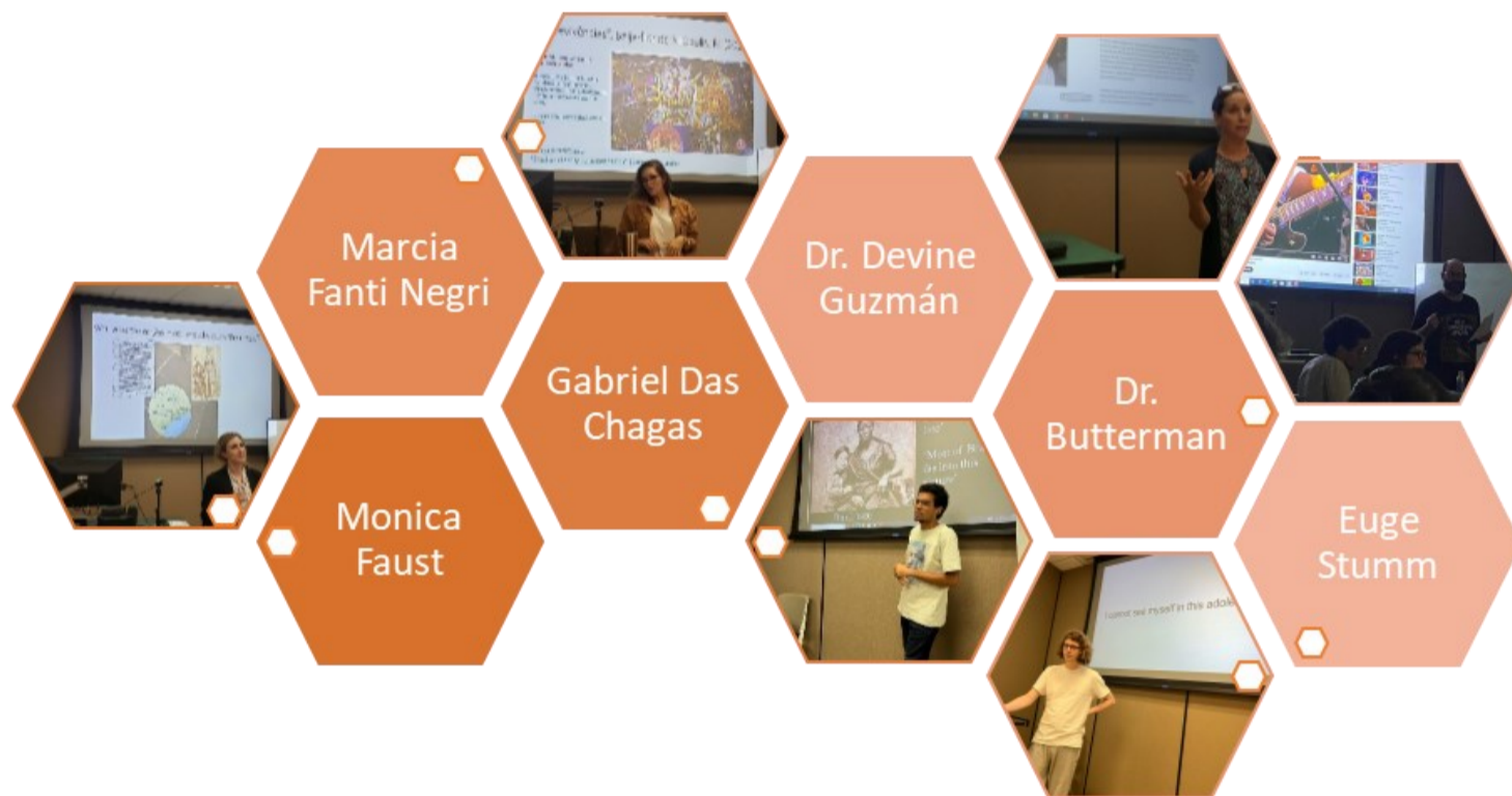
Photographs from the Portuguese Program Teach-In on November 16, 2022.

Michele Bowman Underwood Department of Modern Languages and Literatures